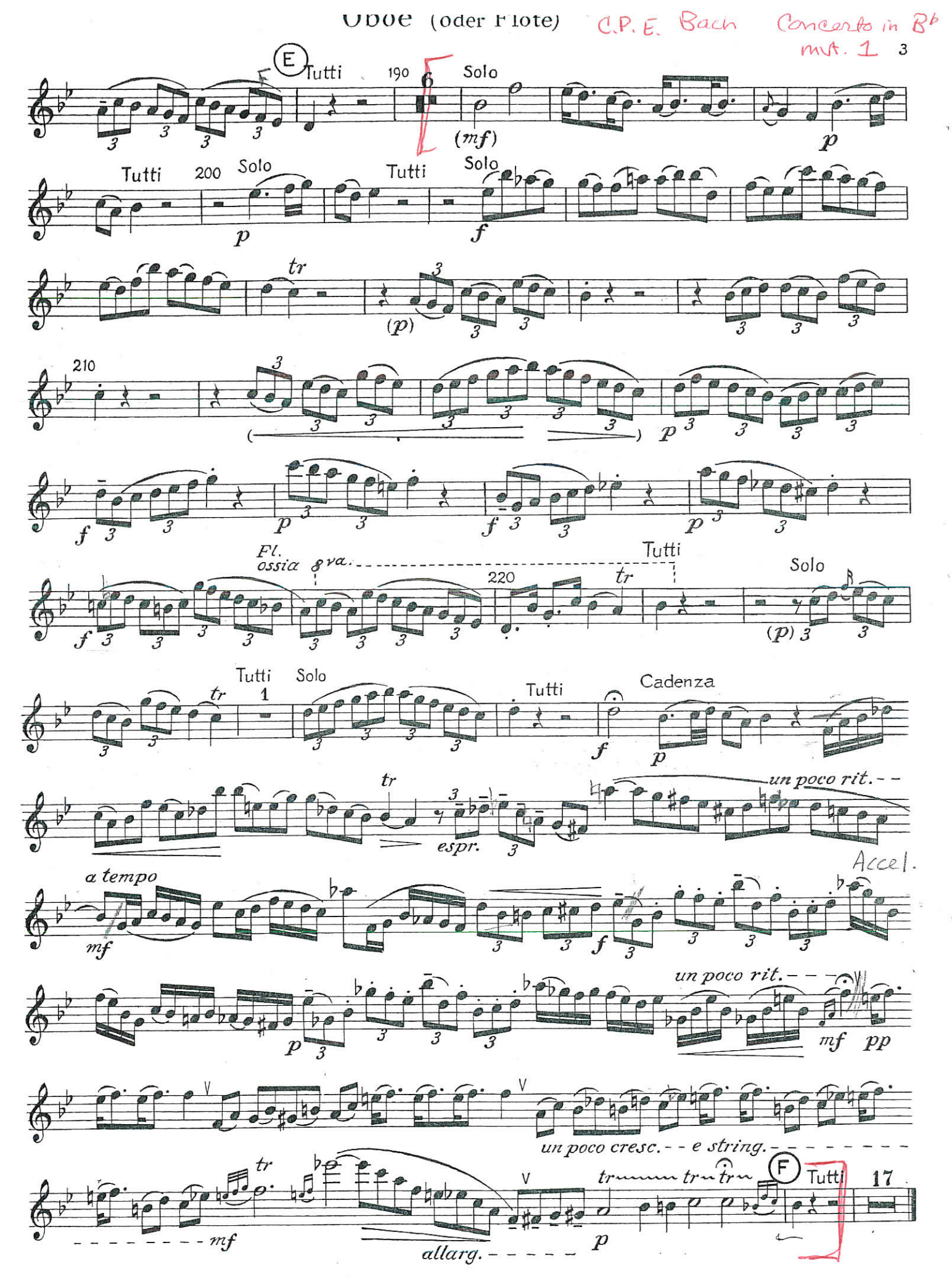
F. E. C. L. 9416