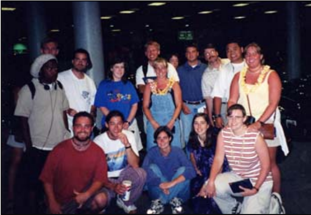
Hawaiian Tour in 1998