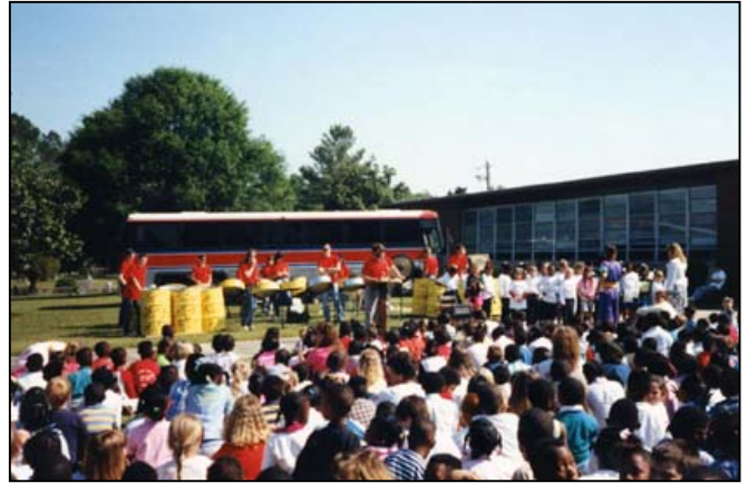
Mullins, SC Trip in 1991