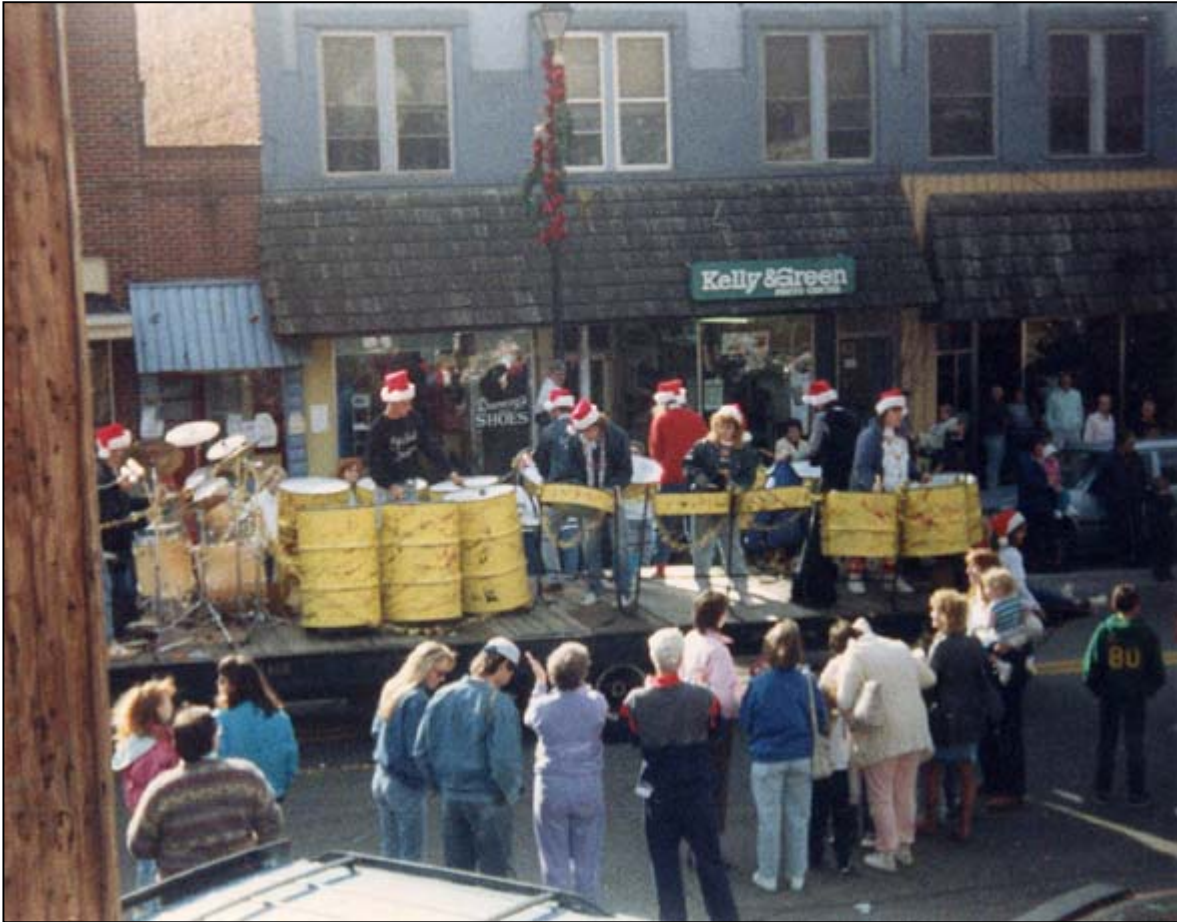
1989 Boone Christmas Parade, Downtown Boone