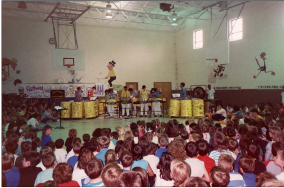
Parkway Elementary School, Boone, NC