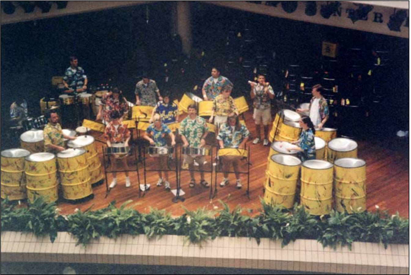
Performing in May 1998 at the Ala Moana Shopping Center in Hawaii