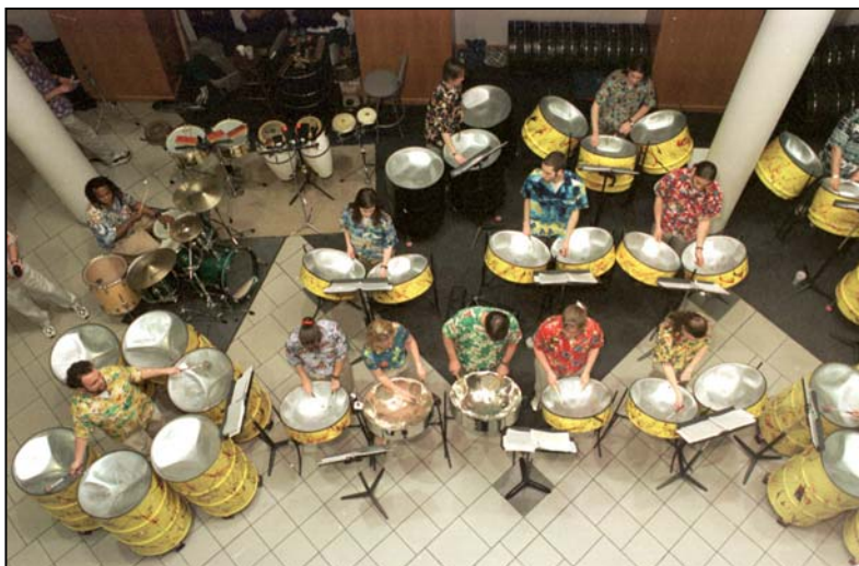
March 1998 at the ASU Student Union