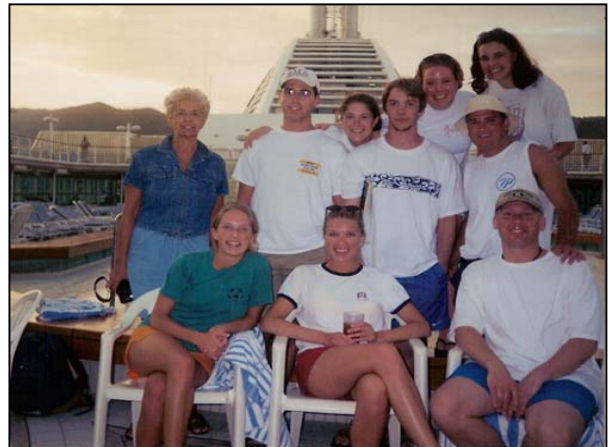
The 2001 Cruise