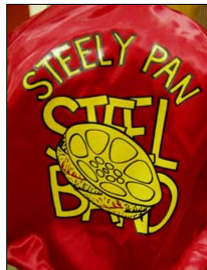
One of the original band members jackets