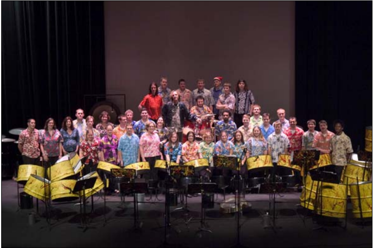
The Steely Pan Steel Band Alumni Band Farthing Auditorium April 23, 2005