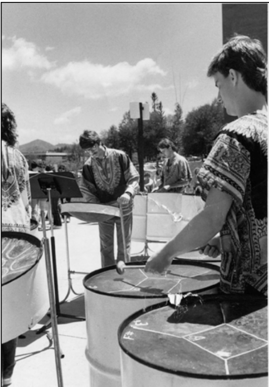
The very first performance on the front steps of the Broyhill Music Building