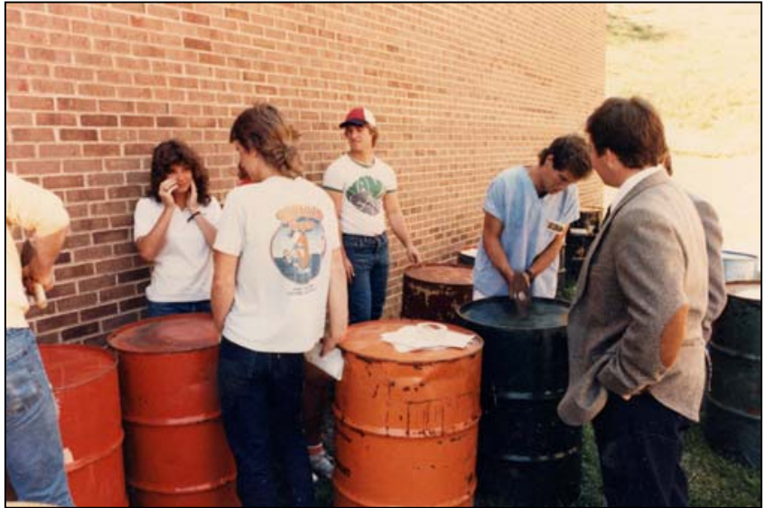
Students making their first steel drums