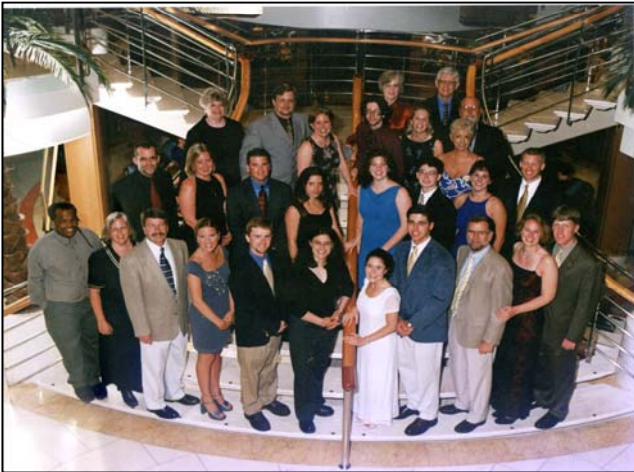
Caribbean Cruise in 2001