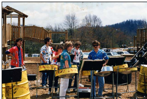
Hardin Park Elementary School, Boone, NC