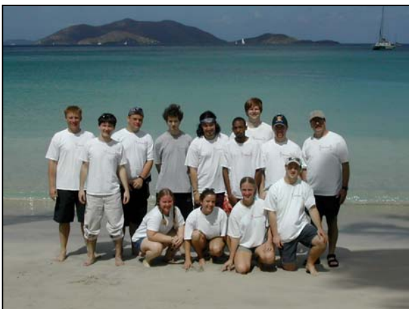
Caribbean Cruise in 2003