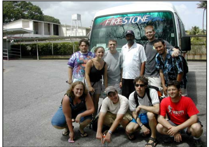
Trinidad Program in '01, '03, and '05