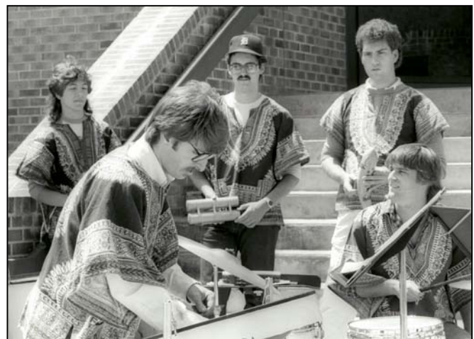
The first-ever performance