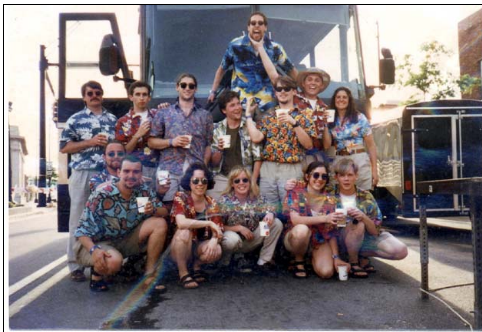
Greenville, SC outdoor performance in 1995