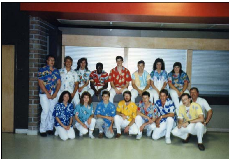
Mullins, SC in 1991